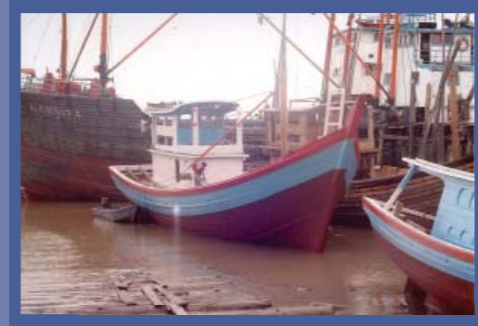
The 6 boats and the equipment were handed over to the Panglima Laot Fisherman's Association thus guaranteeing a sustainable maintenance.

MAN Ferrostaal financed the construction of another 6 big fishing boats (4 at 23 m & 2 at 15 m length) for the towns of Bireuen / east coast and Meulaboh / west coast. Besides the 6 boats, an ice plant, a water treatment unit and reservoir plus 2 Diesel generating sets were procured.